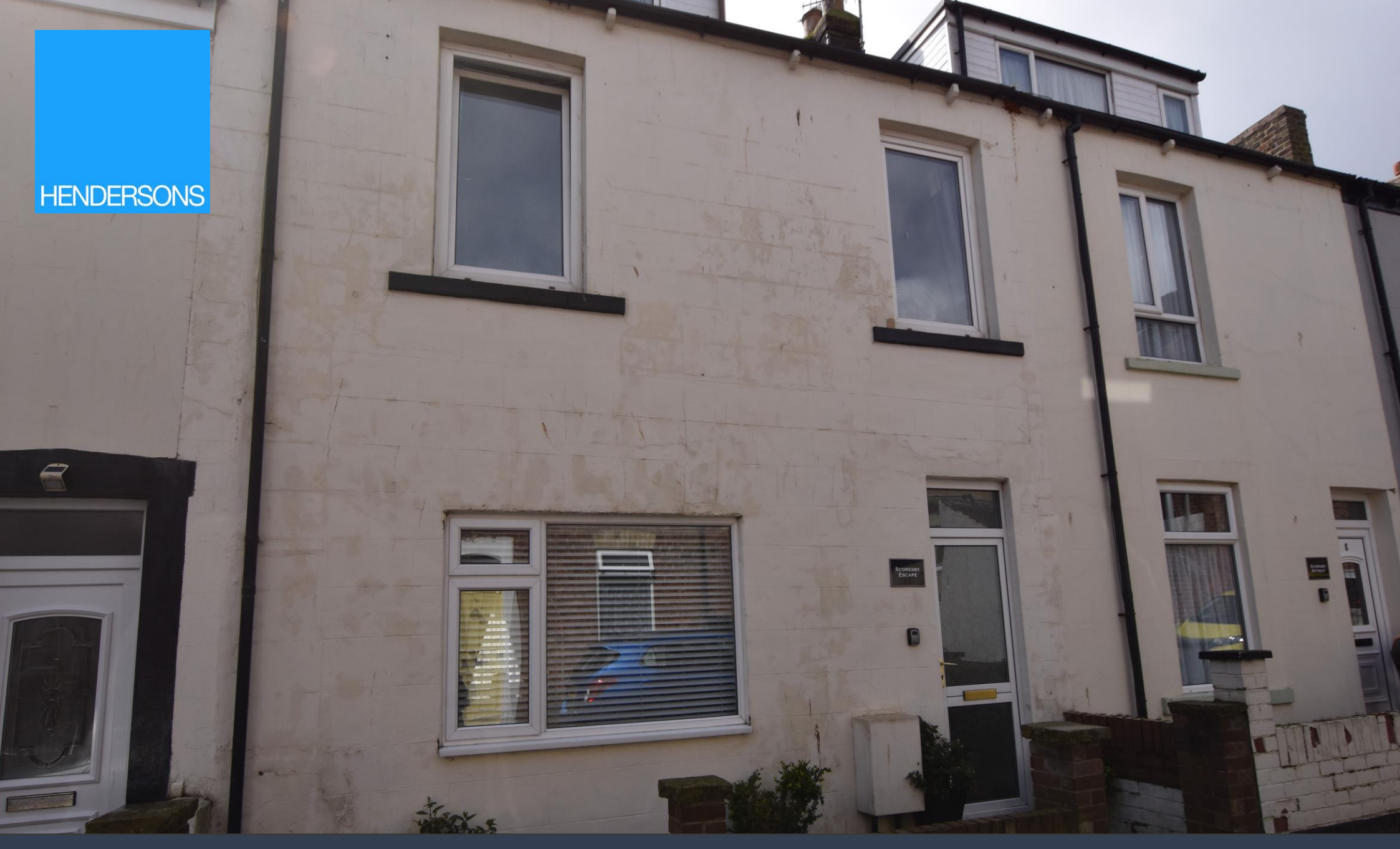
7, SCORESBY TERRACE, WHITBY